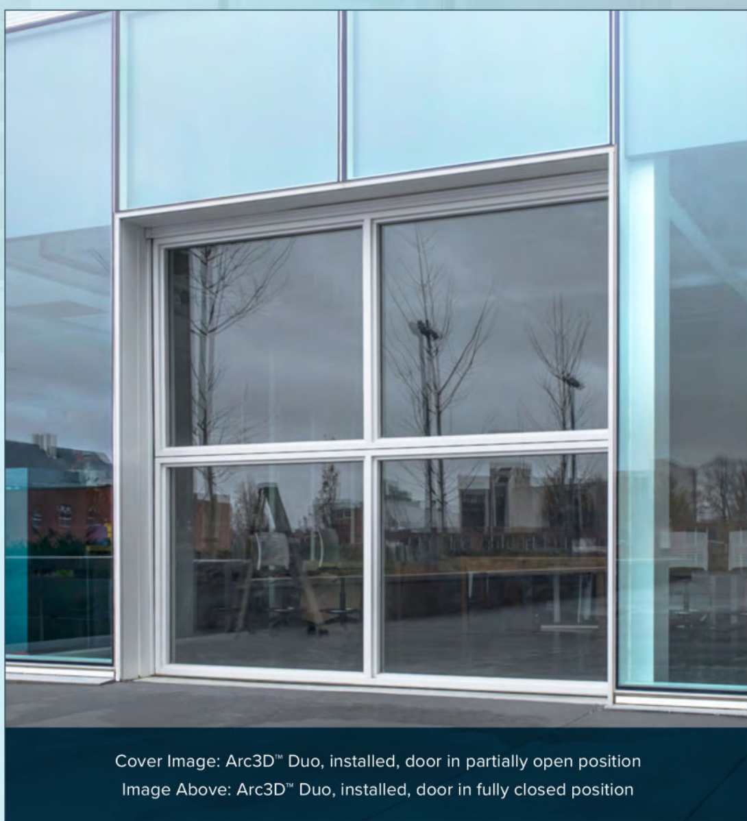
Cover Image: Arc3D™ Duo, installed, door in partially open position Image Above: Arc3D™ Duo, installed, door in fully closed position

At DoorWall Systems we help commercial architects achieve beautiful open space solutions with advanced engineering.